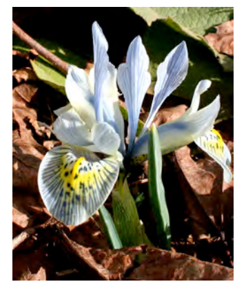
Iris histrioides' Katharine Hodgkin'

This iris is one of the stunning results McMurtrie has achieved, and it took 10 years to bring it to market. The white flower has ink-blue starbursts on the standards and the falls combine yellow stripes with indigo spots. Grows 5" to 7" high.