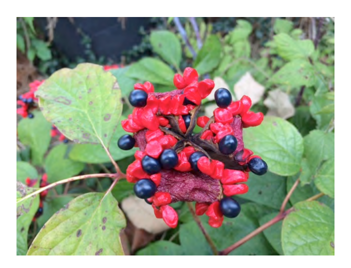
Species Peony in seed, perhaps even showier than its spring flowers.