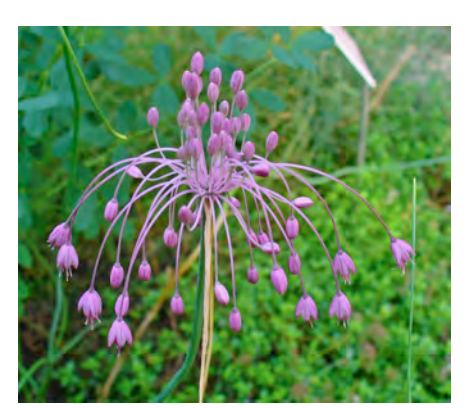
Allium carinatum ssp.pulchellum

The 2" to 3"-wide flowers are reddish-violet, bell-shaped, and gracefully pendulous. This would be enough to recommend it, but the blooms are even more distinctive because each displays florets that sit on top of protruding anthers. This is one of the smaller, somewhat later-blooming allium. Zone 5. Height: 16". Bloom time: June/July.