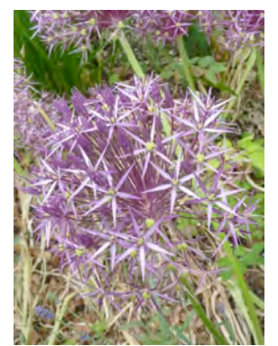
Allium christophii

Allium christophii (circa 1884) Aptly known also as the Star of Persia, this long-lasting allium displays 8"- to 10"-wide, loosely formed globes of amethyst florets with a starry metallic cast and green eyes—bringing an extra-terrestrial aura to the garden. Zone 4. Height: 18"-24". Blooms May/June.